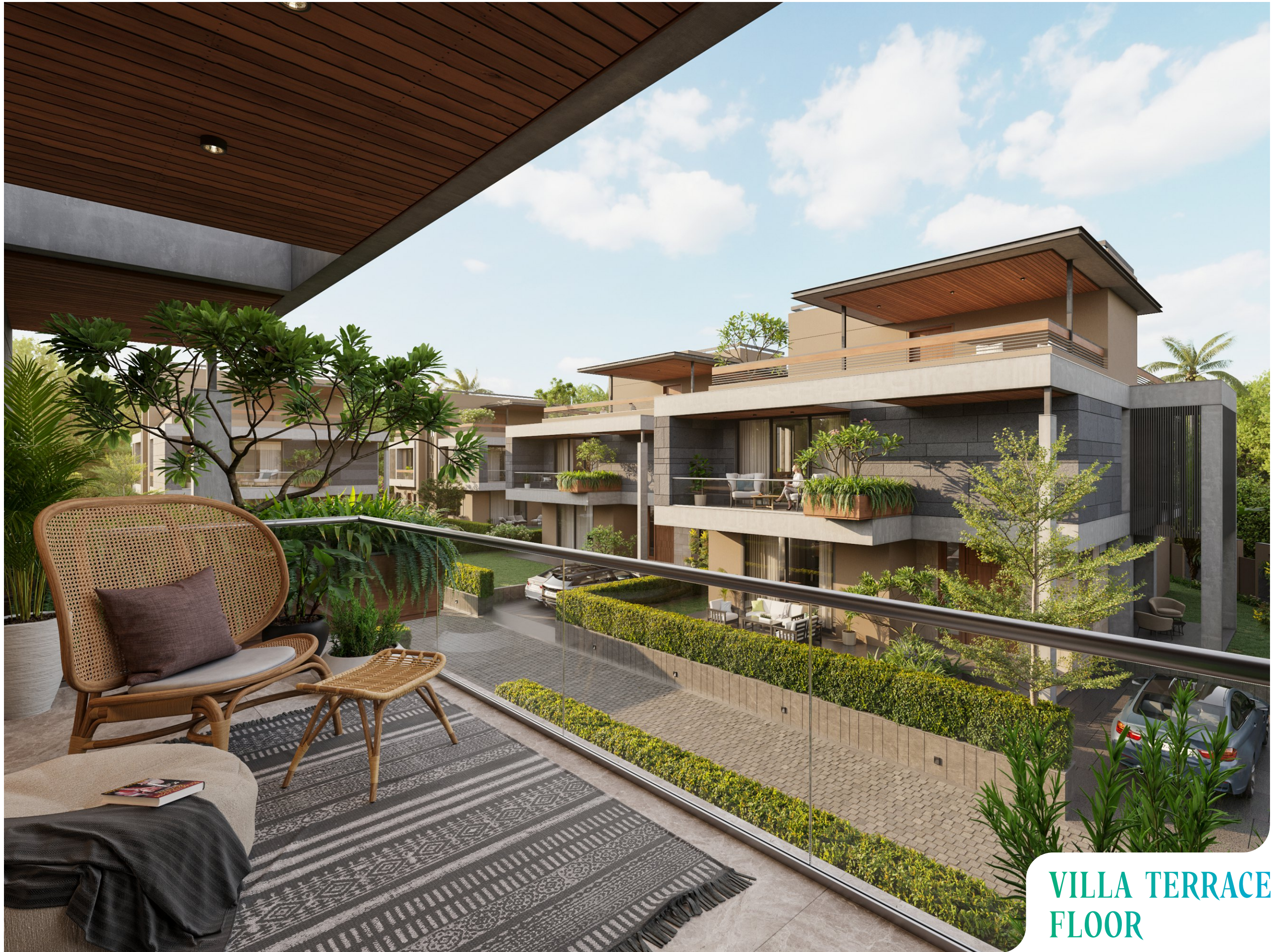
VILLA TERRACE FLOOR