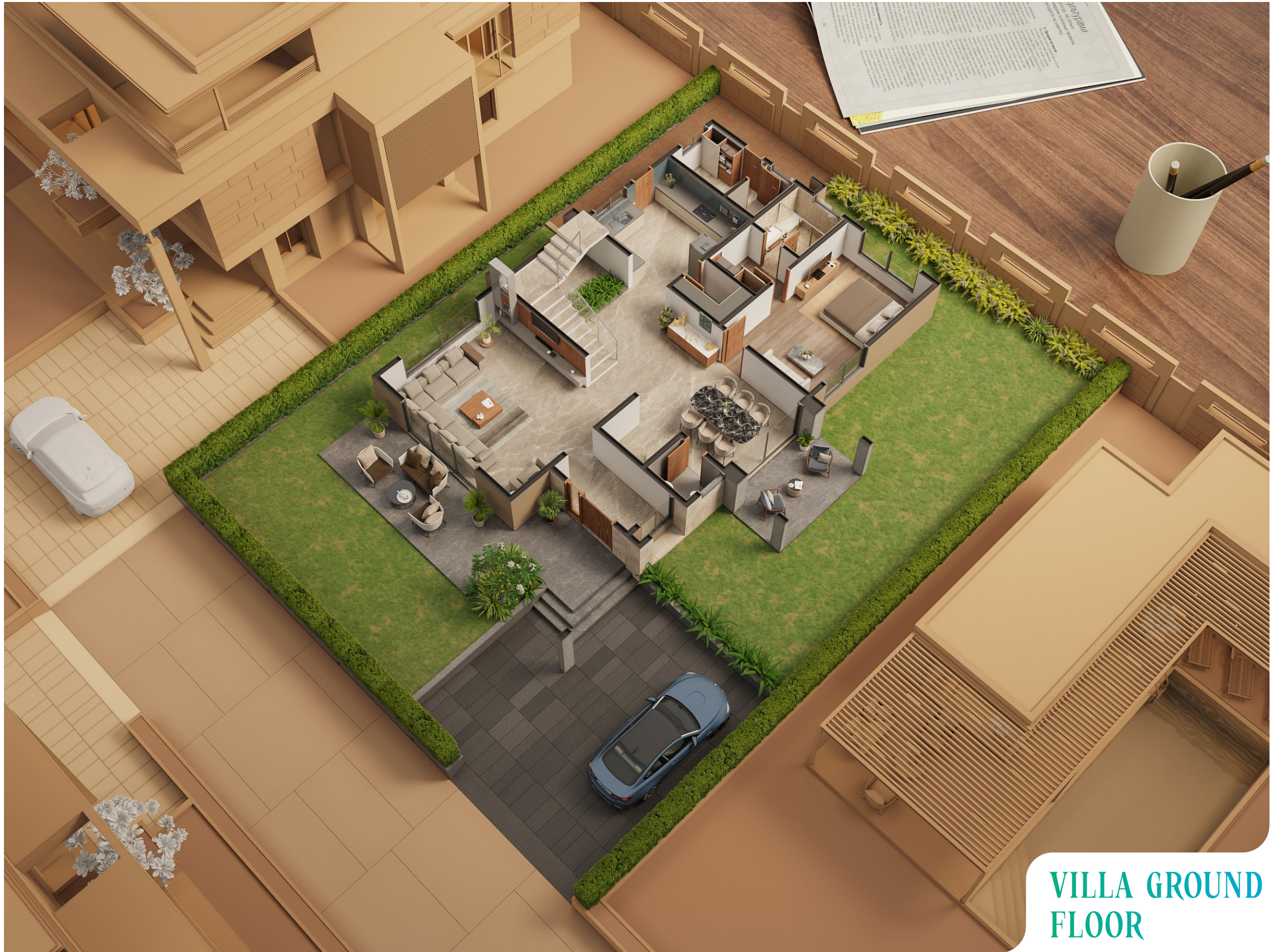
VILLA GROUND FLOOR