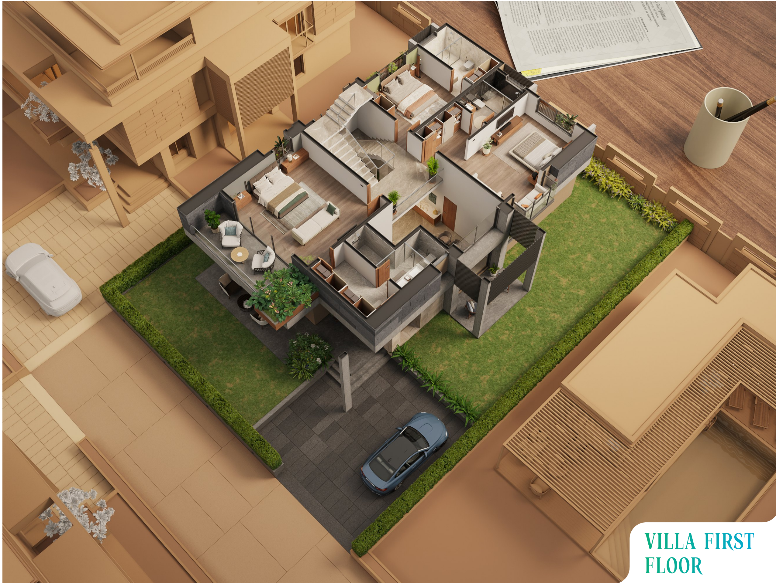
VILLA FIRST FLOOR